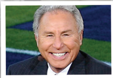
Lifetime Achievement Award ESPN Broadcaster & Analyst Lee Corso